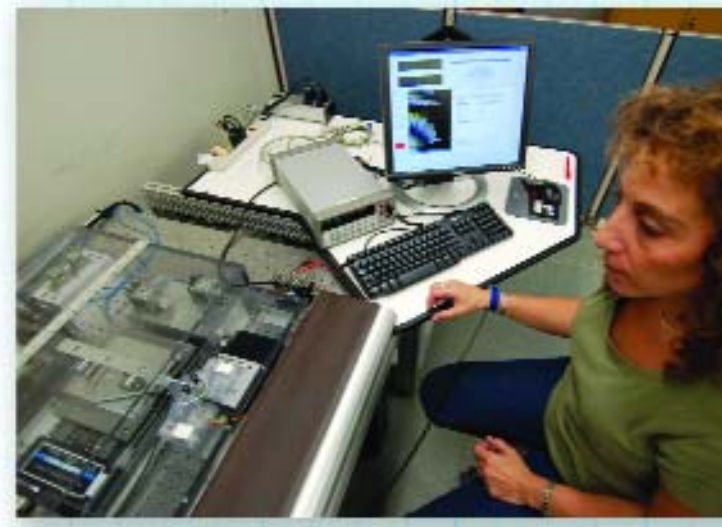
Automated laser interferometer calibration

Kaman truly believes in partnering with our customers, and you can call on our depth of experience. We provide design for manufacturing, concurrent engineering, prototype testing, and other services. The benefit of involving Kaman as early as possible is shortened time-to-market.