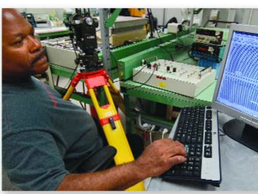
Optical assembly final test