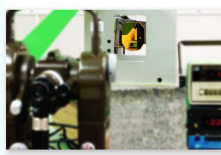
Theodolite incident angle measurement for optical assembly linearization calibration

OUR ASSETS ARE MANY, BUT WE ARE ALWAYS UPGRADING. IF YOUR PROJECT NEEDS NEW EQUIPMENT, WE'LL ACQUIRE IT.