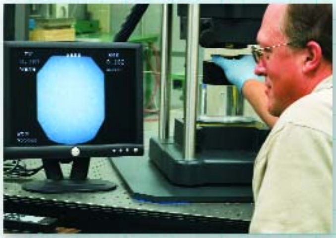
Steering mirror testing